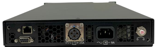
Rear Panel with AC IN, DC OUT, Communications, and SNMP Interfaces