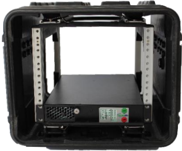
The Acumentrics 1/2 Rack UPS Shown in a 1/2 Rack Transit case