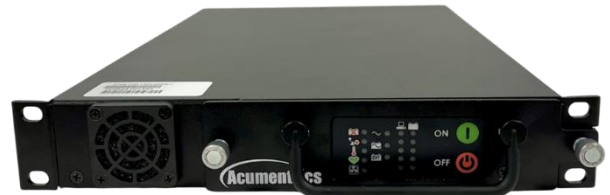
Front Panel control and indicator panel

AC in, DC Out 20-29VDC, 1000W, LFP Battery, SNMP