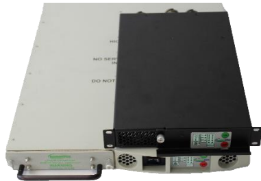
The Acumentrics 1/2 Rack UPS provides the same 1000W of power in less than have space of a full-size UPS.